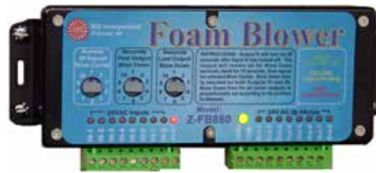
BLOW DOWN TIMER